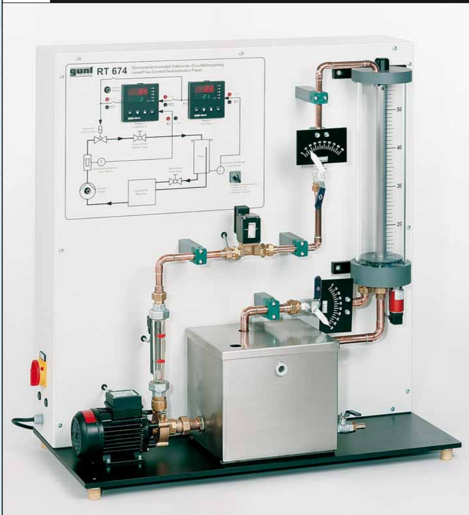
RT 674 Flow / Level Control Demonstration Unit