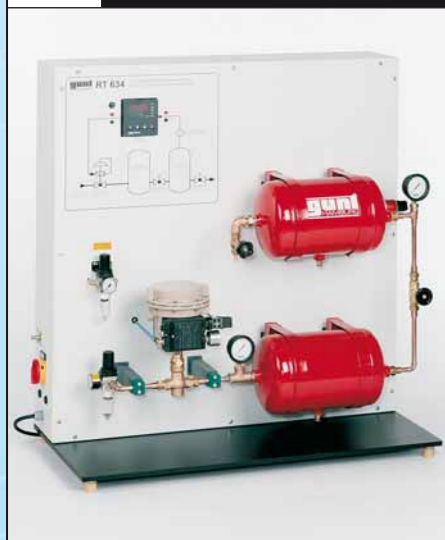
RT 634 Pressure Control Demonstration Unit