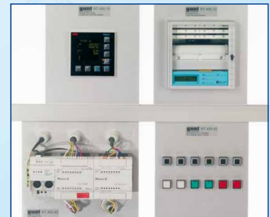
All modular in design – only the latest components from actual practice