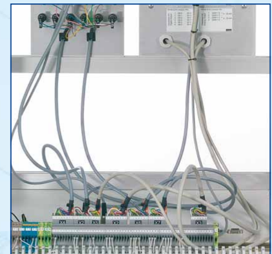
Industry-standard, flexible cabling