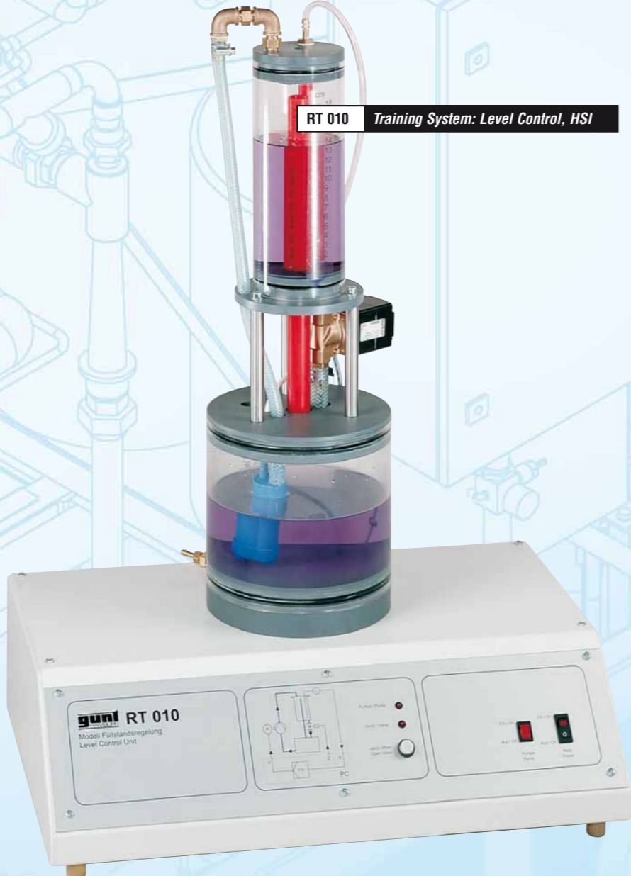
RT 010 Training System: Level Control, HSI

The network capability of the software enables teacher/student systems to be established.