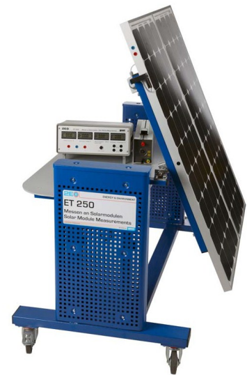
ET250 - Solar Module Measurements