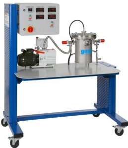
WL377 - Natural Convection & Radiation