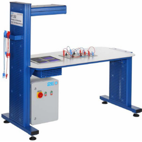
ET252 - Solar Cell Measurements