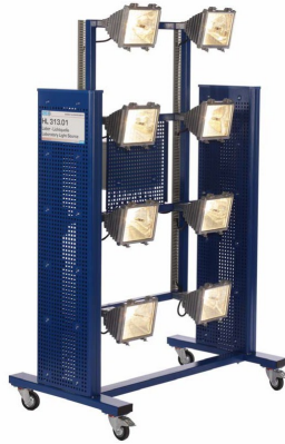
HL313.01- Artificial Light Source