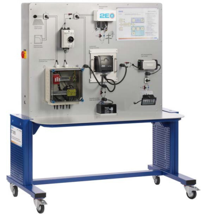
ET255 - Using Photovoltaics: Grid connected or Stand-alone