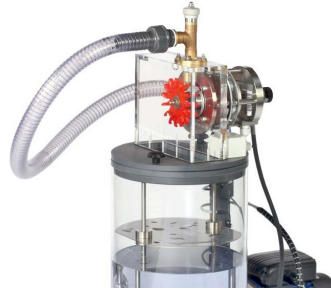
HM289 - Pelton Turbine Demonstrator