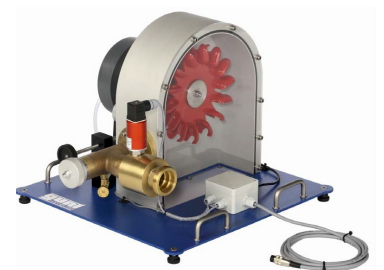
HM450.01- Pelton Turbine