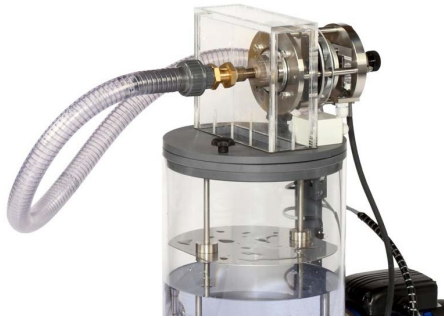
HM288 - Radial-Flow Reaction Turbine Demonstrator