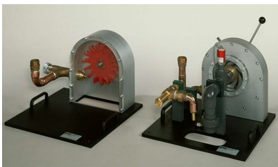
HM365.31 Pelton & Francis Turbine