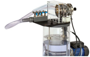
HM291 - Axial-Flow Impulse Turbine Demonstrator