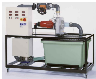
HM430C - Francis Turbine Trainer